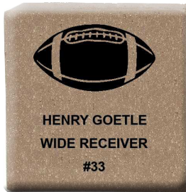
8x8 Landmark Gray Sample Brick w. Graphic