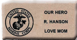
4x8 Lighthouse Gray Sample Brick w. Graphic