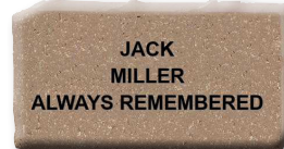
4x8 Landmark Gray Sample Brick